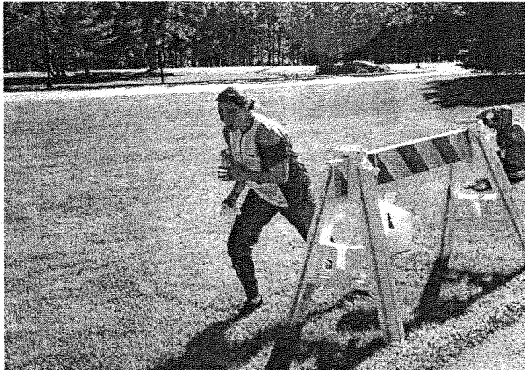
Unidentified orienteer at 2004 US Relay Champs in New Gloucester, Maine