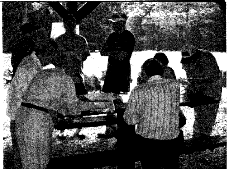
-Registration at the mini Rogaine in Rock City